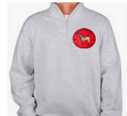
Sweat Shirt Sample

This year CKC Embroidery is making the clothing with our National's logo. Since several people have asked for clothing with the CSPCA logo, you can also purchase clothing and items with the CSPCA logo. They are offering Embroidery, Sublimation, and Screen Printing. You can get Jackets, Tumblers, Hats, Vests, Bags, Aprons, etc. The logo on T-shirts will be with sublimation and screen printing, unless there is a special request for embroidery.