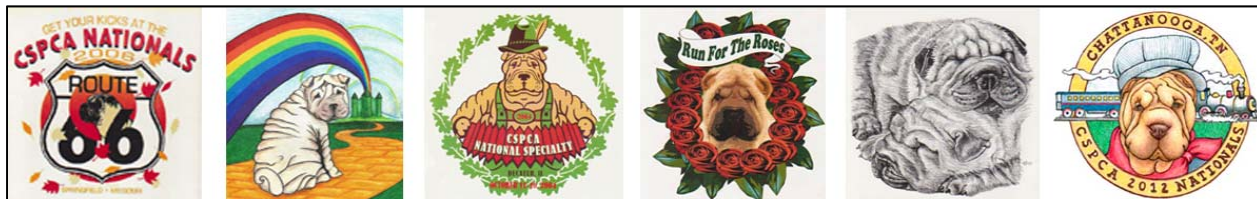
Past Nationals Logos

Members.....we are looking for those with artistic ability to submit a logo for our 2021 Nationals to be located in Lisle, IL. The person whose logo is selected will be awarded $100.00. The deadline for your submission is April 1, 2020.