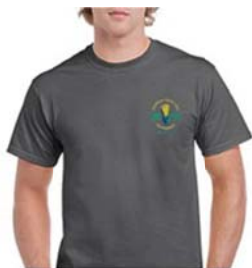
Dark Heather Tee Shirt

ALL ORDERS MUST BE PICKED UP AT NATIONALS - PAYMENT MUST BE SENT WITH PRE-ORDER FORM - DEADLINE FOR PRE-ORDERS: AUGUST 1, 2018