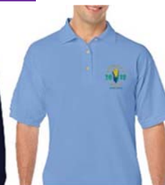
Carolina Blue Pique Sport Shirt