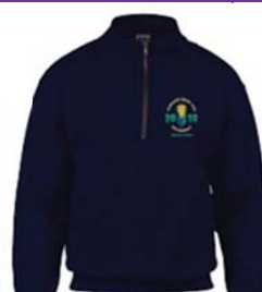
Navy Blue 1/4 Zip Collar Sweatshirt