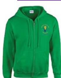
Irish Green Full zip Hooded Sweatshirt