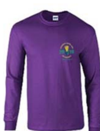
Purple Long Sleeve T-Shirt