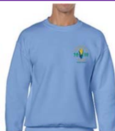
Carolina Blue Crewneck Sweatshirt