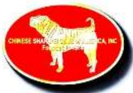
Twenty Year Pin

40 Years of Continuous Membership- You will receive the 40 year pin plus your dues will be reduced to $10 per year.